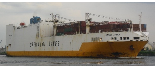
Identical sister ship „Grande Africa“ in Hamburg.

The “Grande America” of Grimaldi was built in 1997 and operated between Europe and Western Africa in a rotation together with several similar vessels. This type of ships allows for transportation of cars, trucks, trailers and containers. It combines the features of a container ship with those of a “roll on, roll off” ferry and is therefore known as “conro” ship.